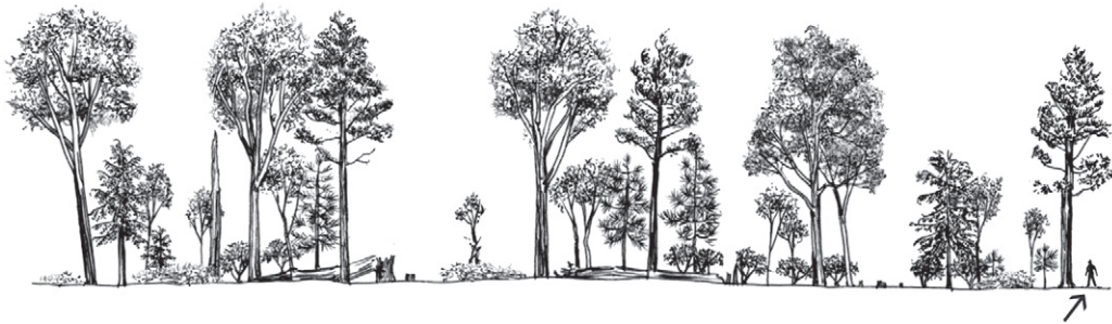
Fig. 1. Forest illustrations presented in survey. Illustration A reflects a forest that has not been harvested. Illustration B reflects a forest that has had a timber harvest but no removal of residual woody biomass. Illustration C reflects a forest that has had a timber harvest and removal of residual woody biomass.